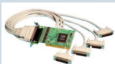
UC-271: LP uPCI 4xRS232 DB25