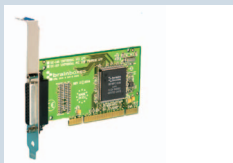
UC-146: uPCI 1xLPT Printer Port