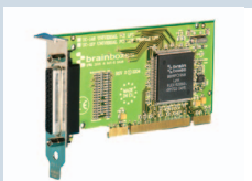
UC-157: LP uPCI 1xLPT Printer Port