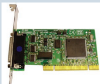
UC-072: uPCI 4xRS232 Opto Isolated TX RX GND