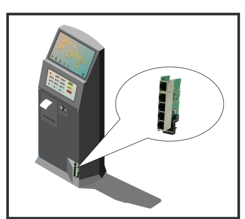
Ideal for mounting within passenger information terminals or kiosks