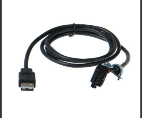
PW-650 Power supply with USB connector and prewired screw terminal block. Suitable for use with 5V USB ports.

PW-600 Power supply with connectors for UK, USA, EU and AUS mains socket. 'Tails' are suitable for connecting to screw terminal blocks.