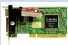
UC-464: LP uPCI 1xRS232 + 1xLPT