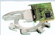
UC-346: uPCI 4xRS422/485 1MBaud