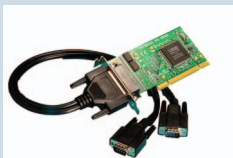
UC-734: uPCI 2xRS232