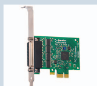
PX-701: PCIe 4xRS232 1MBaud