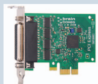
PX-260: LP PCIe 4xRS232 1MBaud