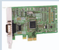
PX-235: LP PCIe 1xRS232 1MBaud