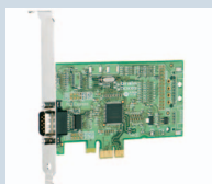
PX-246: PCIe 1xRS232 1MBaud