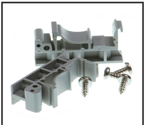
MK-048 DIN Rail Mounting Kit Enables device to be clipped onto a DIN rail.

PW-600 Power supply with connectors for UK, USA, EU and AUS mains socket. 'Tails' are suitable for connecting to screw terminal blocks.